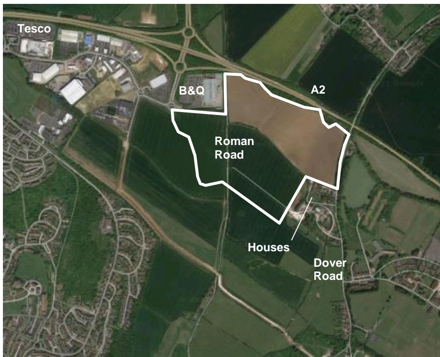
Figure 3: Site and Surrounding Context