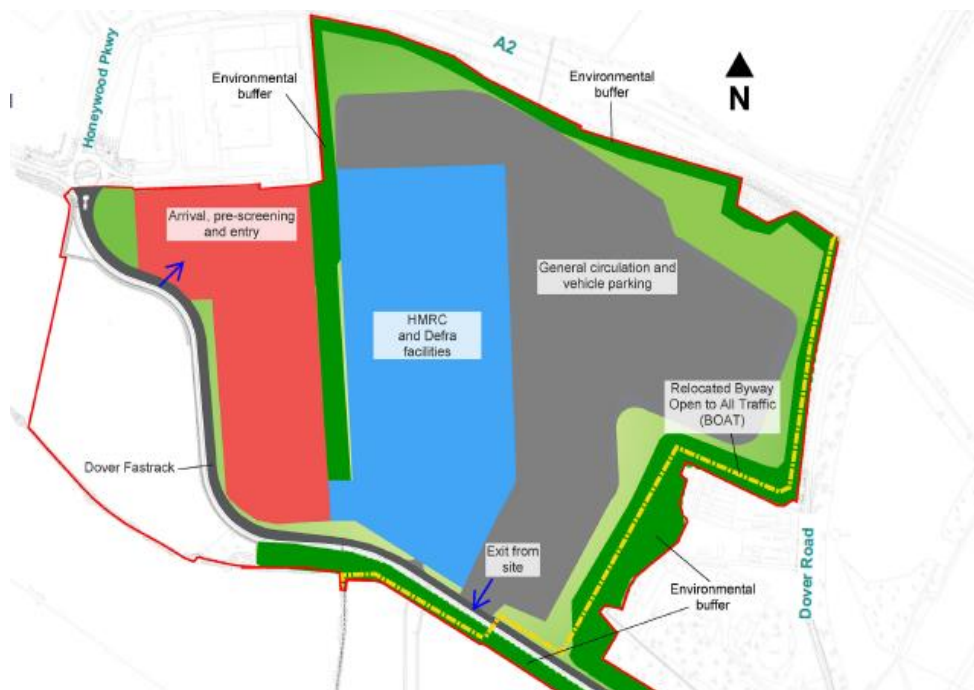
Figure 4: Schematic Layout of Proposed IBF

1.14 The IBF development would be temporary for a period until December 2025, whereafter (under the SDO) the Site would need to be reinstated in accordance with details to be submitted to and approved by the 'Secretary of Secretary of State for Housing, Communities and Local Government' in due course.