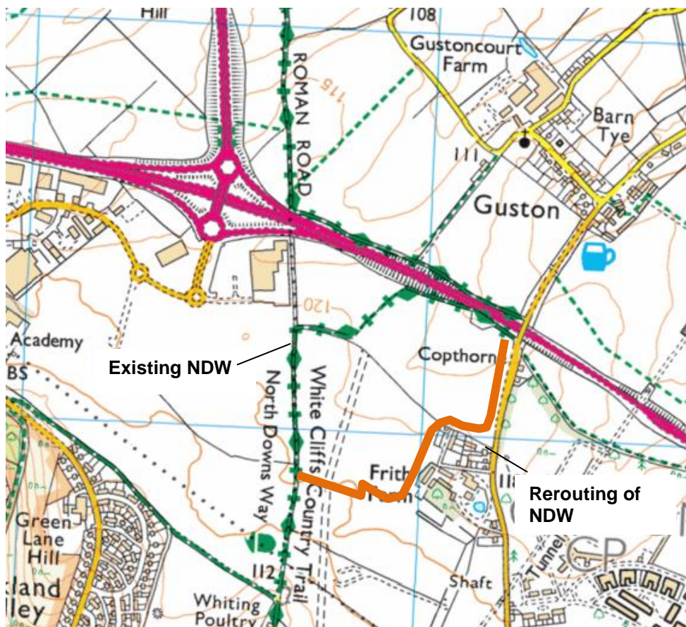
Figure 5: Existing and Proposed Route of North Downs Way